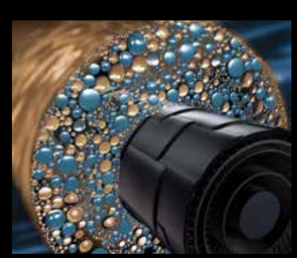
A mixture of DYES, OIL and PROTEIN EXTRACTS surrounds hair's cuticle