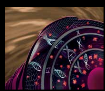
The hair strand is 2X FORTIFIED* and infused with COLOR