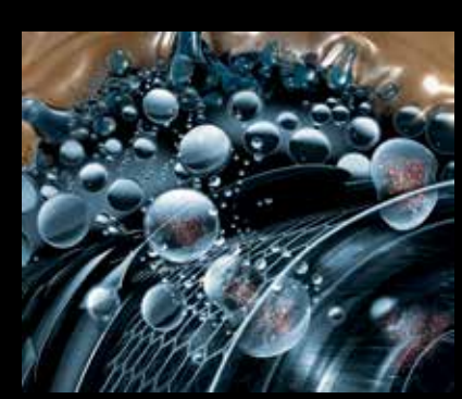
ODS 2 propels DYES and PROTEIN EXTRACTS into the cortex